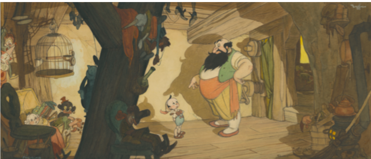
Gustaf Tenggren, Pinocchio concept art; collection of the Walt Disney Animation Research Library, © Disney