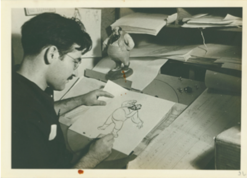
Photograph of Vladimir Tytla