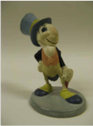
Disney Studio Artist, Jiminy Cricket character model; plaster, metal alloy, and paint; collection of the Walt Disney Family Foundation, Jiminy Cricket © Disney