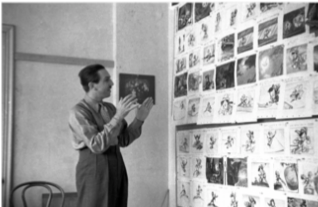
Walt at a Pinocchio storyboard meeting