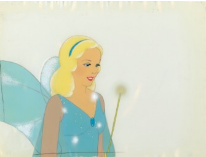
Disney Studio Artist, Blue Fairy cel, Paint on cellulose acetate and opaque watercolor on paper; collection of David Pacheco, © Disney